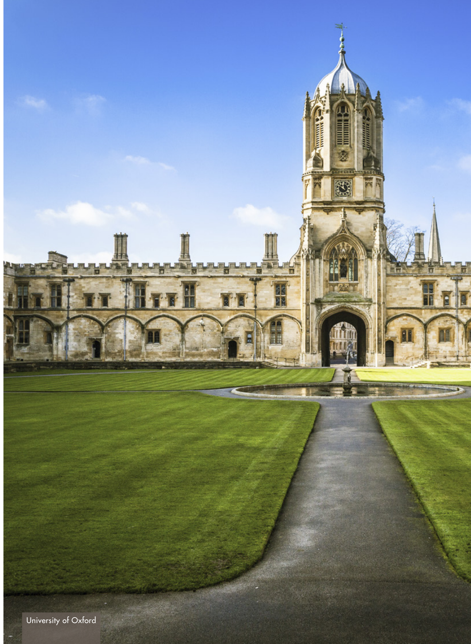
University of Oxford

Thanks to a great choice of bars, eateries and pubs, Oxford also has a thriving nightlife, popular with students and young professionals.