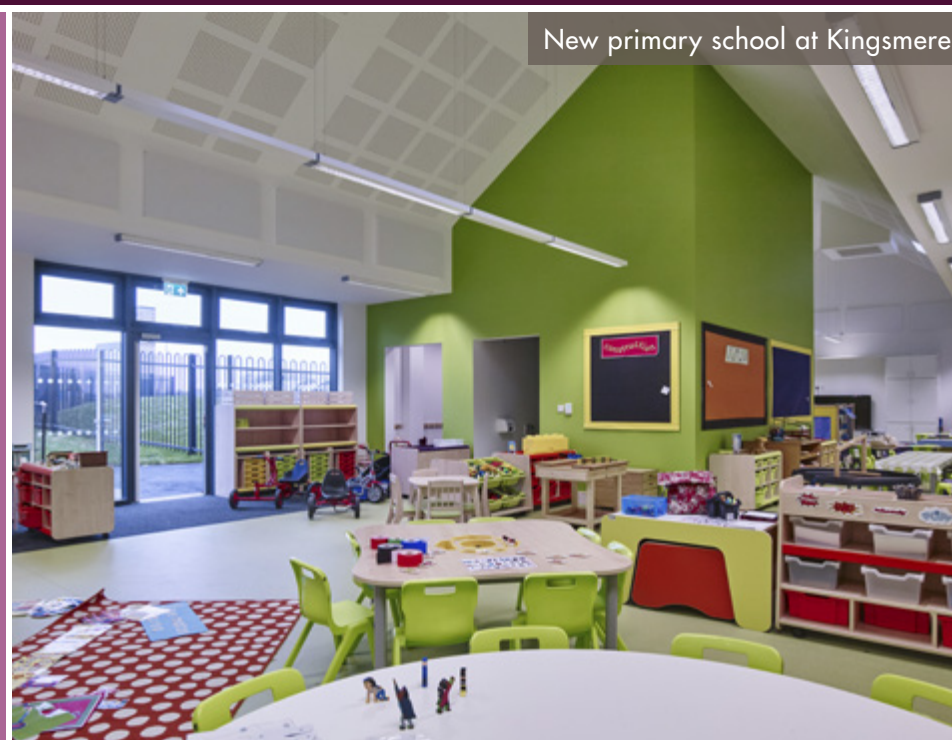
New primary school at Kingsmere

Kingsmere is perfectly placed for schools with 13 primary schools within three miles and two well regarded secondary schools, The Bicester School and The Cooper School nearby.*