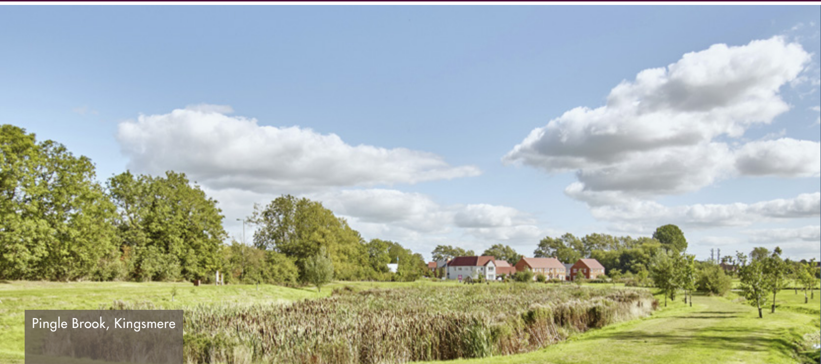
Pingle Brook, Kingsmere

It’s not just local people flocking to make a home at Kingsmere – a variety of bird and butterfly species are nesting and flourishing here. Pairs of lapwings have been spotted around the ponds at Pingle Brook. Other species enjoying the welcoming environment include mistle thrushes, reed buntings and small blue butterflies.