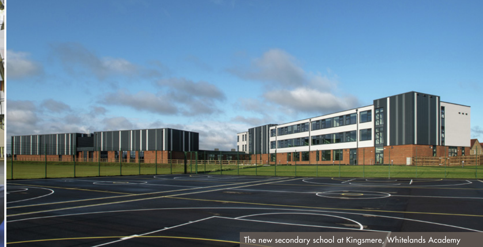
The new secondary school at Kingsmere, Whitelands Academy